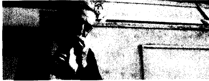
Portrait of Clyfford Still