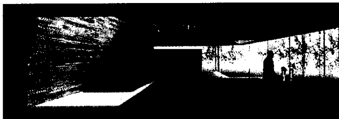
Proposed renderings of the Clyfford Still Museum Created by Brad Cloepfil of Allied Works Architecture